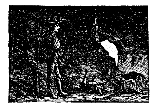
Paul Bert's (1886) version of the guide at the grotto and his recumbent dog (9).

skeletons of human beings, animals, and birds which have been asphyxiated in an atmosphere overloaded with carbon dioxide.