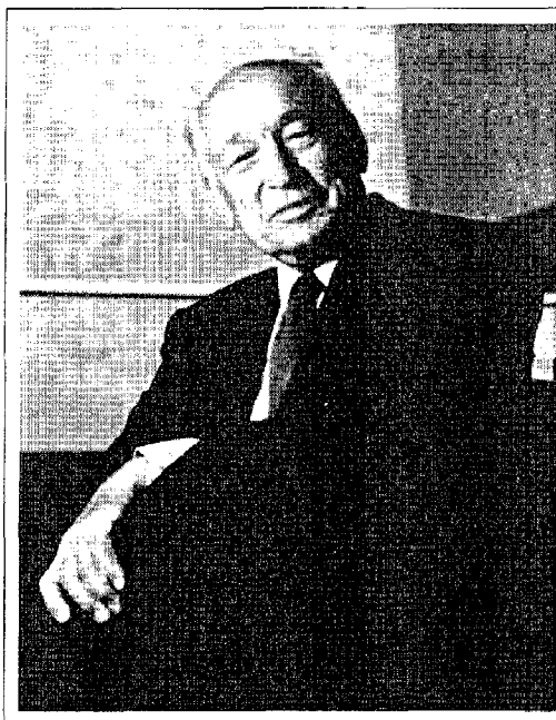
A. O. Beckman, courtesy Beckman Instruments, Inc.

those electrodes that he had employed previously with the various unreliable and difficult to use electrometers. As a result of these discussions Beckman built a two-stage, directly coupled vacuum