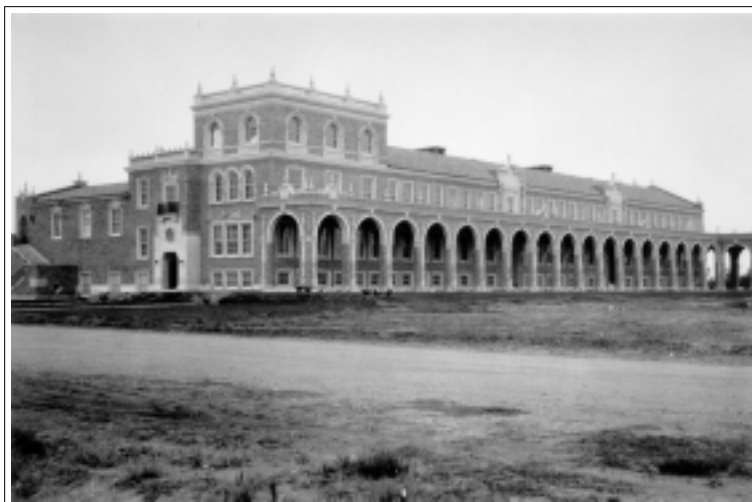
New Chemistry building, Texas Technological College, 1929