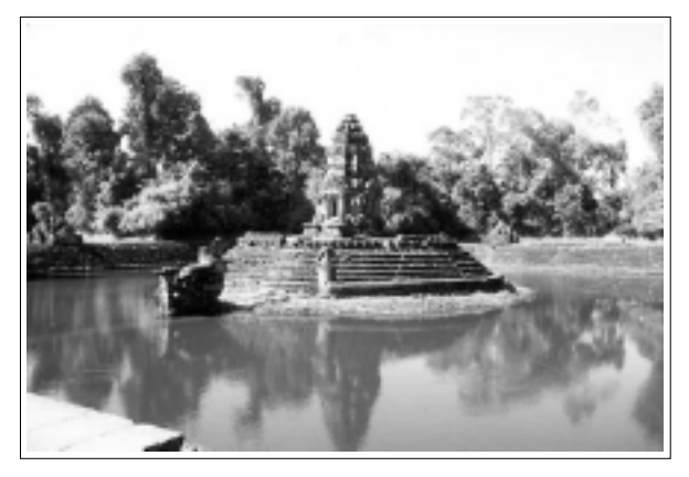
Figure 3. A view of the central island at temple Neak Pean showing the central sanctuary.

The fact that water, earth, air, and fire are the essential religious components of the temple recalls to the historians of chemistry the Theory of Four Elements, usually attributed to Aristotle (384-322 B.C.). In exploring this theory a few years ago, this author came to the conclusion that it originated in Persia from Zoroaster (630-553 B.C.), at least two centuries before Aristotle (4). According to Zoroaster air, water, earth, and fire are "sacred elements." Humans and animals need air to breathe, water to drink, fire for cooking food, and earth for growing plants for their survival. Earth, air, and water are to be kept from defilement. To till the field and raise cattle are parts of one's religious requirements. Rainwater, when it falls in abundance to irrigate the fields, is a blessing from God. When it is scarce, famine may result. Fire creates warmth and comfort