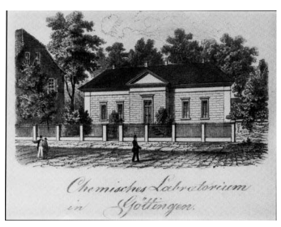
Figure 8. Wöhler's original laboratory, Göttingen

worked even longer. Yet, Pugh doubted that any professor but Wöhler could induce students to work in such a dirty place, with its ten thousand disagreeable odors (29).