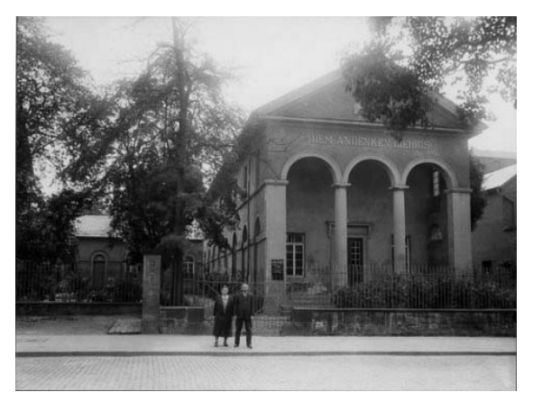
Figure 7. Gießen Laboratory

instruction program he had created. In 1851, when he was offered the Heidelberg professorship (actually taken by Bunsen), he said such a move would be "the ruination of the school at Gießen, which was my pride and its downfall would be the calamity of my life" (26). Students were required to pay a fee each semester, the amount being based upon the number of days they worked, up to a maximum of six days per week. This covered the cost of equipment and reagents, but students were required to pay for solvents and other consumable items and provide their own balances. Liebig would be able to keep an eye on students from his private office, but he maintained intimate contact with students working in the adjacent laboratory, commenting on each one's project, making suggestions, and even predicting results (27).