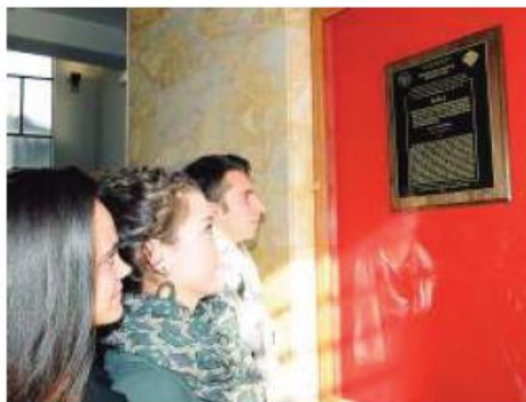
La targa esposta al Liceo scientifico Avogadro

Pointing to great advances in chemistry immediately spark questions such as “What did that project achieve?” and “How did they do their research?” and “How did they figure that out?” and “What was the major finding?” These questions and the thought processes stimulated by them “build capacity by engaging young people . . .”